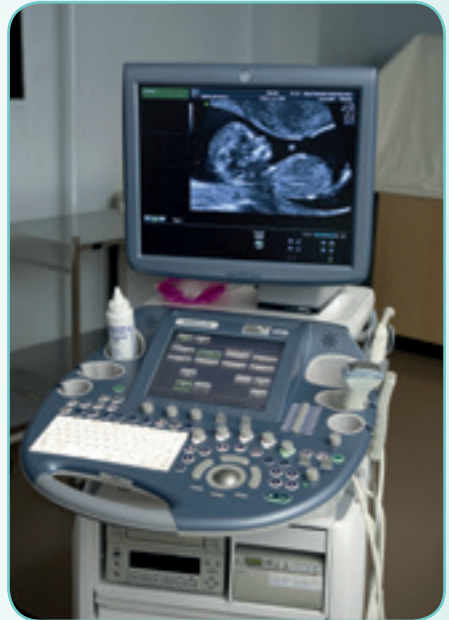
Ultrasound machine used by sonographers during a scan

You will be asked to drink some water before attending for the scan so that you have some fluid in your bladder. This helps the sonographer record better pictures of your baby. The amount of water that you will be asked to drink will depend on the stage of pregnancy. You should have a full bladder for the early pregnancy scan, so should drink about a pint (around 500ml) an hour before the scan. Your bladder does not need to be full before the mid-pregnancy scan, but drinking a glass or two of water will help the sonographer.